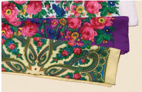
Moldovan Scarf H074114 • $19.99

Your purchase of these handmade items from WorldCrafts allows Second Chance to provide loving support and a fair income to young women and their families at high risk of human trafficking. As WorldCrafts orders additional products from Second Chance in Moldova, this artisan group can help more women avoid sexual exploitation, providing them spiritual hope and a sustainable lifestyle. WorldCrafts is part of the Fair Trade Federation. Please check our Web site for more products and stories! For a free catalog, call 1-800-968-7301. Join us on Facebook! WorldCrafts is a division of WMU®.