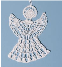
Moldovan Crocheted Angel Ornament H074180 • $5.99 Very limited quantity. Call 1-800-968-7301.