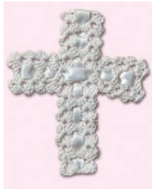
Crocheted Cross Bookmark H054128 • $4.99 Very limited quantity. Call 1-800-968-7301